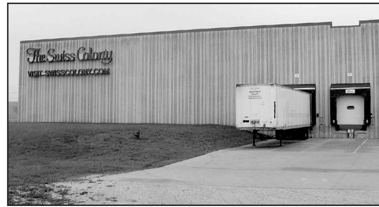
Peosta, IA - Fulfillment Center 8970 Enterprise Dr.

Acquired: 1999 Function: Receive and store non-food merchandise; fulfill orders for ship-alone non-food items Shifts: First shift all year; partial second shift Regular Employees: 15 Temporary Employees: 90 Building Size: 544,000 square feet