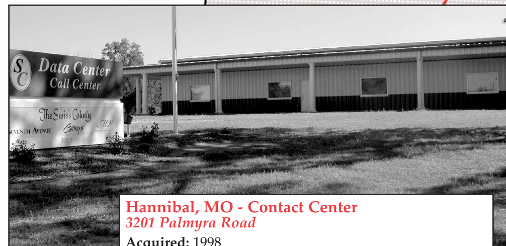
Hannibal, MO - Contact Center 3201 Palmyra Road

Acquired: 2005 (1998 in previous location) Shifts: First shift all year; second shift most of the year Regular Employees: 15 Temporary Employees: 125 Departments: Returns Function: Receive and process customer returned product for non-food catalogs and ship customer orders Building Size: 175,000 square feet