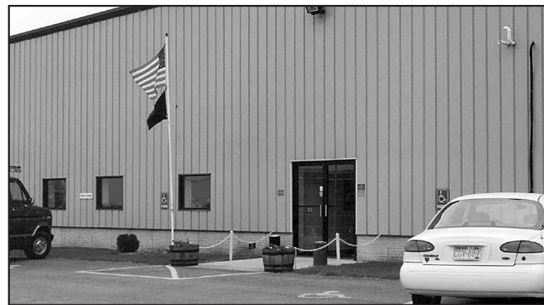
DeWitt, IA - Fulfillment Center - 219 East Industrial Street

Acquired: 1987 Function: Assemble food gifts Shifts: First shift all year; second shift during the season (about July through December) Regular Employees: 6 Temporary Employees: 165 Building Size: 61,440 square feet