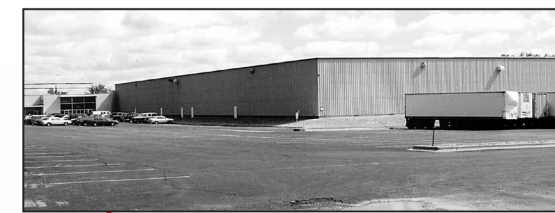
Madison, WI Fulfillment Center - 3650 Milwaukee St.

Acquired: 1978 Departments: Non-Food Combinable Picking/Packing and Receiving. Madison also has branches of Clerical, Human Resources, and Quality Assurance