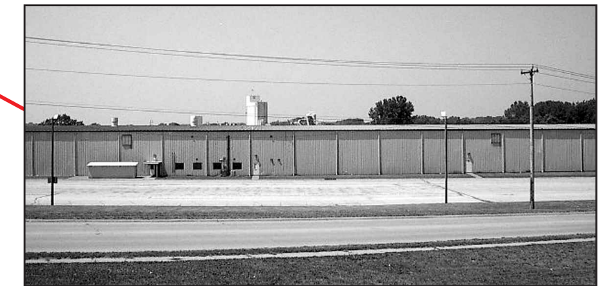
Clinton, IA - Fulfillment Support Center 2000 Harrison Drive

Acquired: In Clinton since 1994 Function: Receive orders from customers for all catalogs by telephone and internet, and provide customer service Shifts: First and second shift all year Regular Employees: 12 Temporary Employees: 370 Building Size: 5,110 square feet