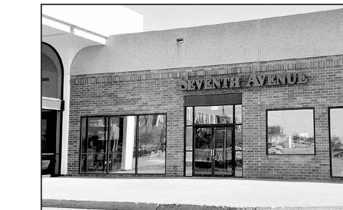
Davenport, IA - Outlet Store Northpark Mall, 320 W. Kimberly

Acquired: 1995 Departments: Fulfillment Center, Hand Art, Engraving, Embroidery, and Customizing Department Function: Engrave and personalize items; fulfill orders for non-food catalogs Shifts: First shift all year; second shift most of the year Regular Employees: 20 Temporary Employees: 135 Building Size: 50,000 square feet