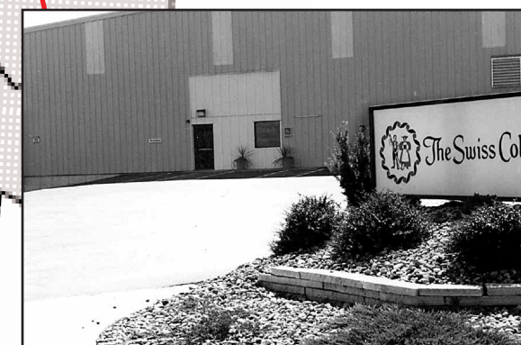
Clinton, IA - DM Services Inc. 1515 South 21st Street

Acquired: 1998 Function: Receive orders from customers for all catalogs by telephone and internet, and provide customer service Shifts: First and second shift all year Regular Employees: 27 Temporary Employees: 990 Building Size: 14,950 square feet