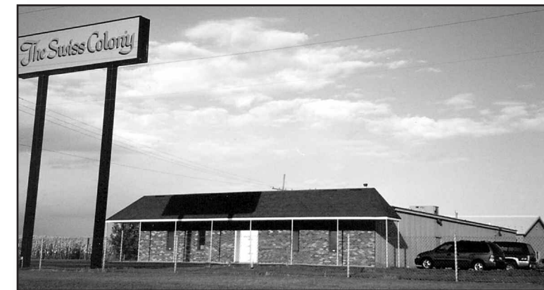
Dickeyville, WI - Contact Center 400 S. Main

Acquired: 1998 Function: Sell close-out inventory and returned items at reduced prices Shifts: Days, evenings, and weekends Regular Employees: 2 Temporary Employees: 10 Building Size: 7,500 square feet