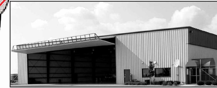
Janesville, WI - SC Aviation Rock County Airport 4120 S. Discovery Drive

Function: Receive all mail and fax orders, receive product and fulfill orders for non-food catalogs Shifts: First and second shift all year Regular Employees: 60 Temporary Employees: 260 Building Size: 225,000 square feet