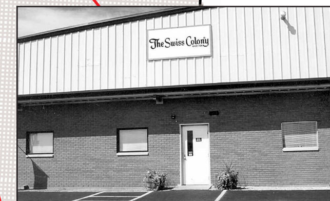
Clinton, IA - Contact Center 1801 South 21st Street

Acquired: In Clinton since 1994 Function: Receive orders from customers for all catalogs by telephone and internet, and provide customer service Shifts: First and second shift all year Regular Employees: 12 Temporary Employees: 370 Building Size: 5,110 square feet