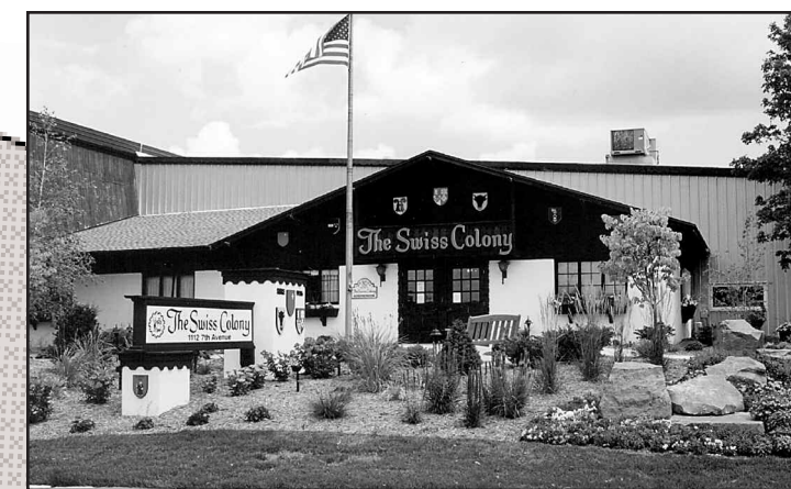
Monroe, WI Corporate Headquarters Built: 1966 See reverse side for details.

Acquired: 1989 Function: Receive orders from customers for all catalogs by telephone and internet, and provide customer service Shifts: First and second shift all year Regular Employees: 16 Temporary Employees: 560 Building Size: 8,266 square feet